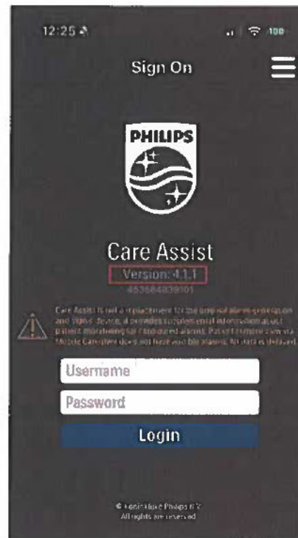
Image 1: Care Assist Login page showing the Care Assist application version number.

The Care Assist Mobile Application version can be found on the mobile application login page, see image 1. below: