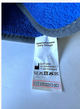
textile sew-in label