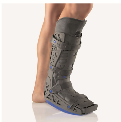
101300 Bort X-Walker long