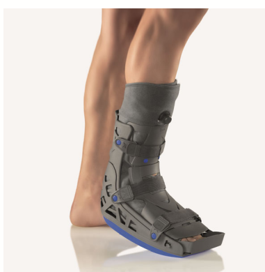
101350 Bort X-Walker short