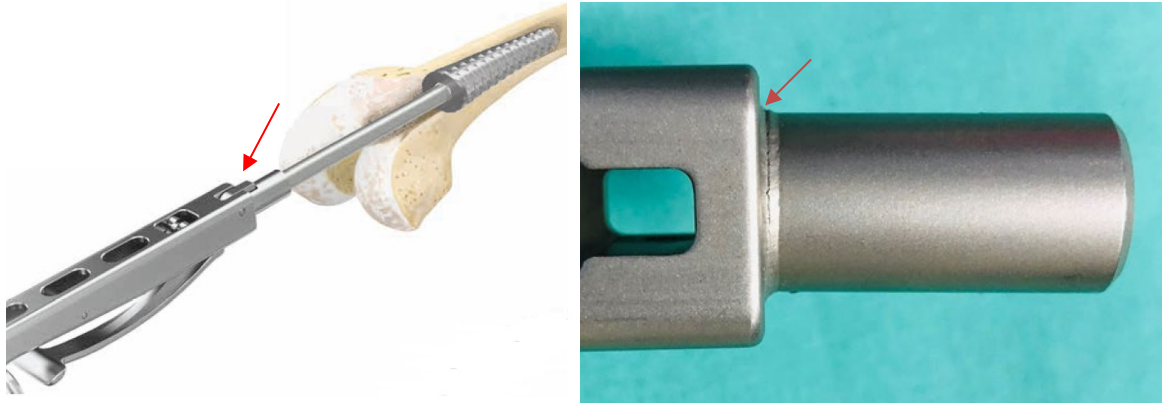
Figure 1: Affected product - Article REF 17-5220/01

Link OptiStem, Rasp Handle Stainless Steel