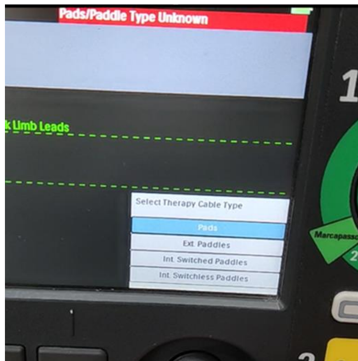
Figure 1: Screen display from DFM100 experiencing paddles misidentification issue.

The Efficia External Paddles may not be properly identified by an Efficia DFM100 or HeartStart Intrepid Monitor/Defibrillator when connected to the device. The device may display an error message reading “Pads/Paddle Type Unknown” as shown in Figure 1. When this occurs, it is accompanied by a menu prompting the user to select a therapy cable type, also shown in Figure 1 below. The message cannot be cleared until the user either selects the cable type, disconnects and reconnects the cable, or restarts the device.