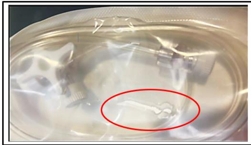
Figure 2: Rupture in the blister packaging