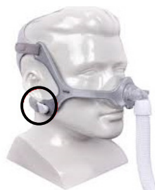
Figure 4: Wisp and Wisp Youth Nasal Mask