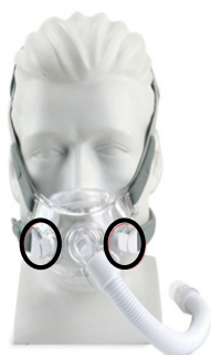
Figure 1: Amara View Full Face Mask

Images of the affected masks are shown below. The magnetic headgear clips on these masks are circled. These images may be used as reference to determine if your or your patient's mask also uses magnetic headgear clips. These masks are intended to provide an interface for application of CPAP or bi-level therapy to patients. The part numbers for the affected masks and mask components that contain magnets are listed in Figure 6.