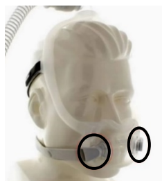
Figure 3: DreamWear Full Face Mask