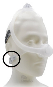
Figure 2: DreamWisp Nasal Mask