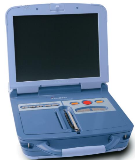
Figure 1. Model 3120 ZOOM Programmer