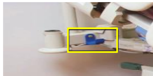
Fig. 1- Compella Cord Hooks.

There are two blue hooks on the inside of the head-end frame to stow the power cords for transport. Wrap the cords around the hooks so that they do not drag on the floor. (Fig 1.)