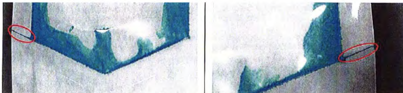
Fig.3: Example images of the penetrated sealing seam (red marking)

The used sterile peel pouches are purchased as prefabricated components from a supplier in Germany and are used at BIP GmbH exclusively for the product REF OTM3.0SRX.