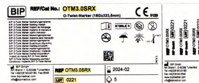
Fig.1: Example label

The corresponding LOT number can be found on the respective product packaging (see Fig.1)