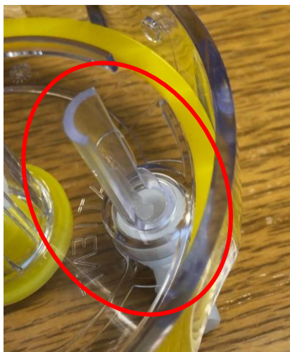
1 Defective Canister Lid