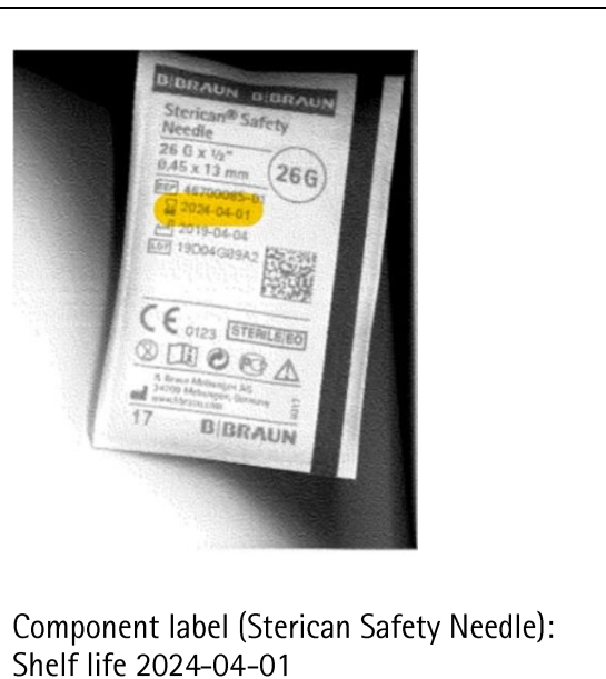
Component label (Sterican Safety Needle): Shelf life 2024-04-01

There is a minor risk of using a Sterican Safety Needle for injection, which is out of shelf life. Injury to patients is very unlikely. Under these conditions we advise the following actions: