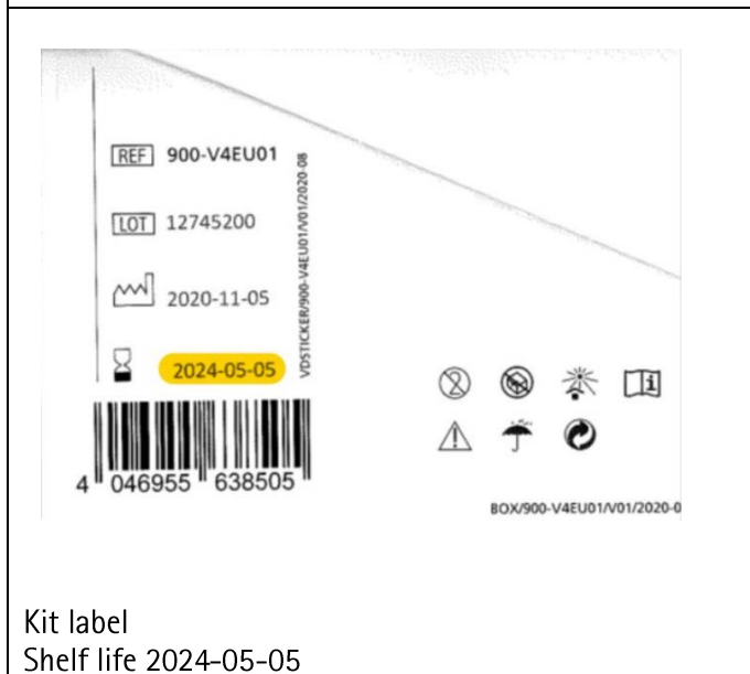
Kit label Shelf life 2024-05-05