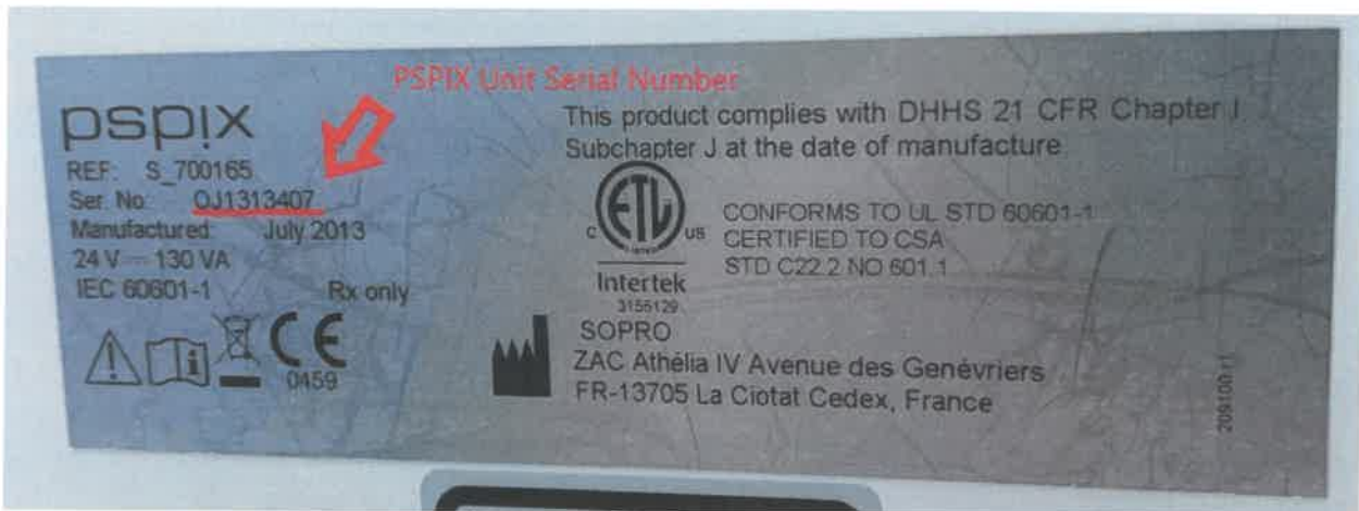
Picture 1: The serial number of the IPS unit is located on its type label at the back of the unit.

The affected IPS unit can be identified by looking at the serial number on the scanner display or the type label at the back of the unit as shown in Picture 1.