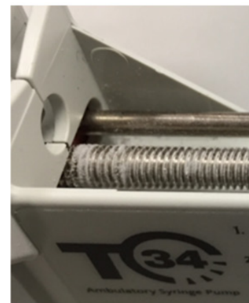
Figure 1: Lead Screw & white plastic debris