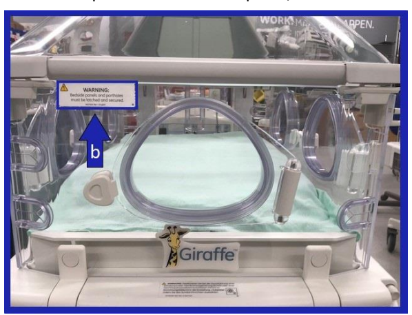
Figure 6: Giraffe OmniBed with Porthole End Panel

g. If your device has an additional porthole on the end panel, attach a Warning Label (Label 2, above) as shown: