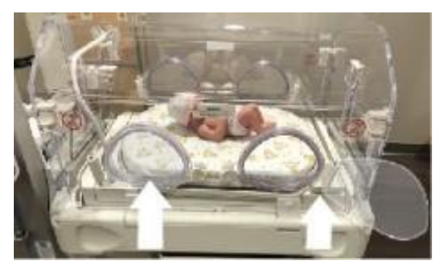
Figure 3. LATCHED (left) and UNLATCHED (right) portholes

2. You must pull on the porthole doors <u>every time</u> the bedside panel or porthole is closed to make sure the porthole door is latched (see Figure 3).