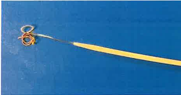
Figure 2 – Coil Present

If you follow the pre-deployment instructions during the preparation of the product, you will see whether there is an implant coil present at the end of the delivery pusher. A delivery pusher with an implant coil should look like figure 2 (below) and a delivery pusher that is missing the implant coil will look like figure 3 (below).