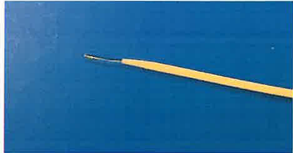
Figure 3 – Coil Missing

A device that has a coil on to the delivery pusher may be used. A device that is missing its implant coil should not be used. A replacement device should be obtained and presence of the coil confirmed per IFU. If the verification steps are not performed per IFU, the user may potentially advance the delivery system without an implant into the peripheral vasculature. Testing shows that the stiffness of the delivery pusher stiffness is not higher than that of regular intravascular guidewire. As a result, the company has concluded that the likelihood of patient harm is improbable.