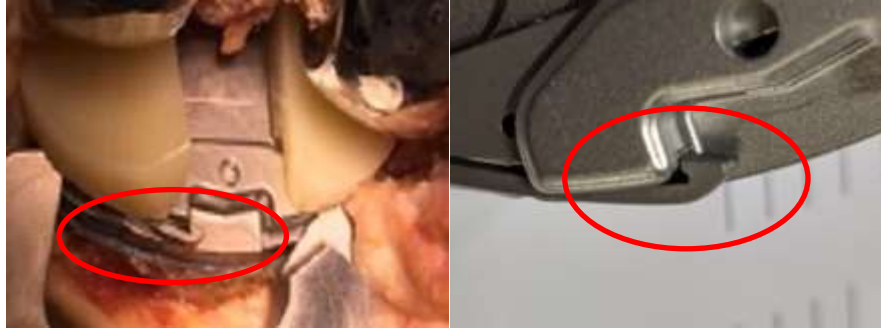
Not Fully Engaged