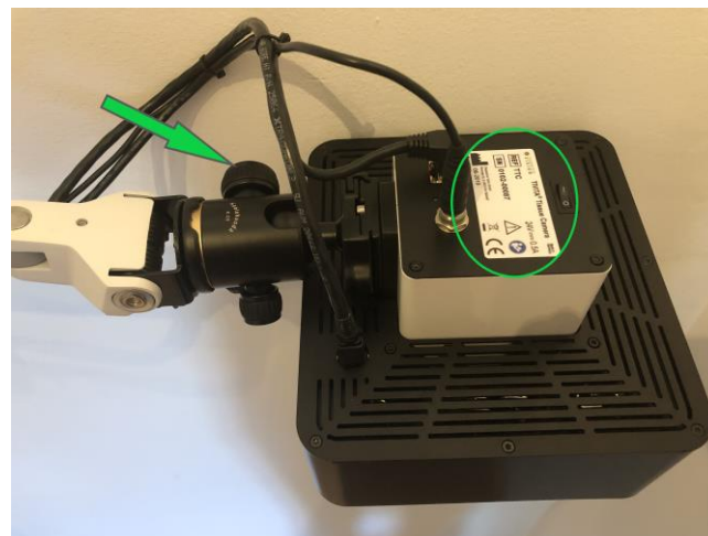
Figure 2: the green arrow marks the screw that loosens the ball head for adjusting the position of the TIVITA Camera; the green circle marks the label where you can find the serial number

Please fill out the form of confirmation for the receipt and the execution of actions and send it to one of the reference persons.