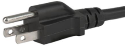
Figure 3: Type B plug DO NOT USE in Thailand, Peru, Brazil

For certain systems in Thailand, Peru, and Brazil, a power cord type B plug rated at 125V, as shown in Figure 3, was shipped. The mains voltage in these countries could be greater than 200V and, as a result, this plug should not be used. If you are located in one of these three countries with mains voltage greater than 200V and have the plug shown in Figure 3, disconnect your Achilles EXP II system from your facility's power supply, and discontinue use of your system. Your power cord set will be replaced with correct power cord. Destroy the incorrect power cord to ensure it is not used.