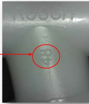
Figure 2 – Identification number (ID)