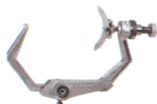
MAYFIELD® 2000 Skull Clamp (A2000)