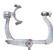
MAYFIELD® Infinity Skull Clamp System (A1114)