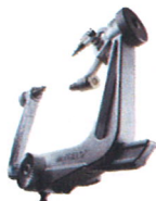
MAYFIELD® Triad Skull Clamp (A1108)