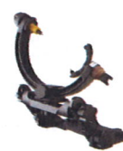
MAYFIELD® MR/X-ray Skull Clamp (A1117)