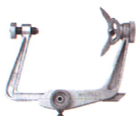
MAYFIELD® Modified Skull Clamp (A1059)

Integra LifeSciences Group is voluntarily reinforcing the MAYFIELD® Skull Clamps, A1059, A1108, A1114, A1117, A2000, A2114, A3059 Instructions for Use and intending to emphasize the current MAINTENANCE and recommended FREQUENCY associated with the safe use of the MAYFIELD® Skull Clamps, listed below: