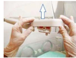
Figure 1 Enhanced Canopy Seal

Note: If the original canopy seals are present, and if necessary to achieve visible cleanliness, you may contact your Biomedical Department or GE Healthcare service personnel for canopy seal disassembly and reassembly