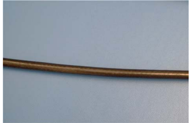
Figure 6: Undamaged and Intact Motor Cable