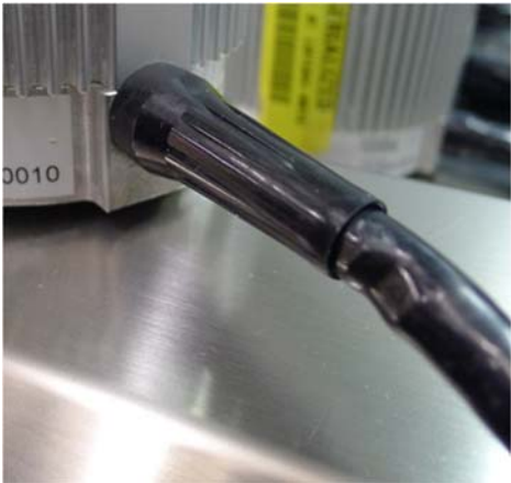
Figure 5: Cable Damage at the Motor Bend Relief