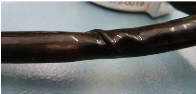
Figure 7: Damaged Motor Cable