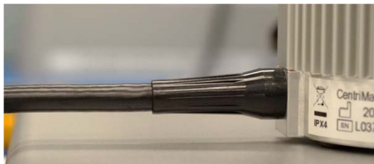
Figure 4: Cable Bend Relief at the Motor