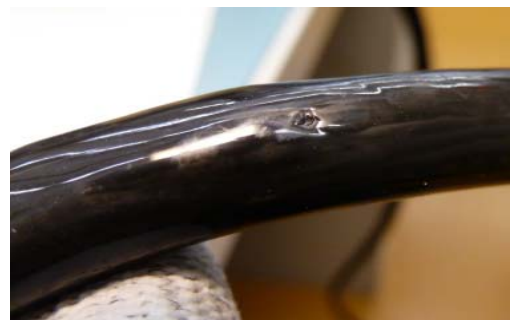
Figure 8: Damaged Motor Cable