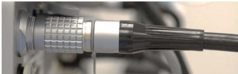
Figure 3: Cable Bend Relief at the Console Connector