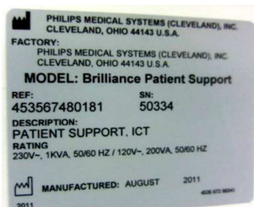
Figure2 (Example: five digit serial number):

The following CT couch six digit serial number ranges are affected: